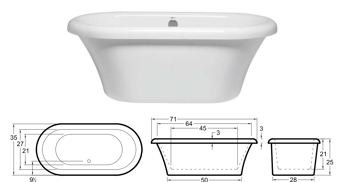
All bathtub dimensions are ± 1/2"

Always check the website for the most updated specifications: www.americh.com