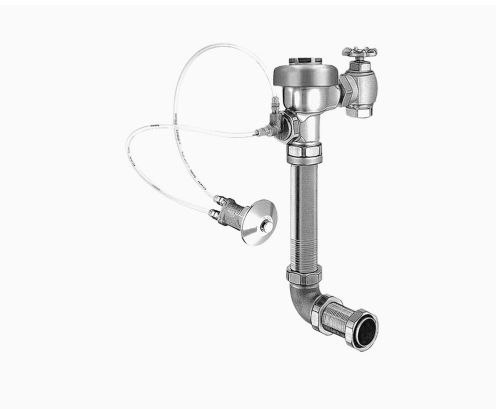
Variations Not Shown: Anti-Flood Device and Metal Button Panel Mount